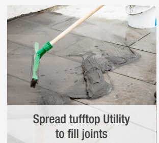
Spread tufftop Utility to fill joints