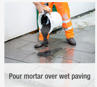
Pour mortar over wet paving