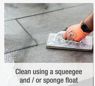
Clean using a squeegee and / or sponge float