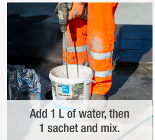
Add 1 L of water, then 1 sachet and mix.