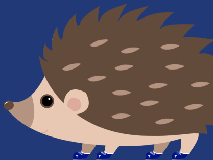
Timmy the timloc hedgehog

Hedgehogs can travel up to 2 miles a night so connecting gardens is vital to enable them to roam.