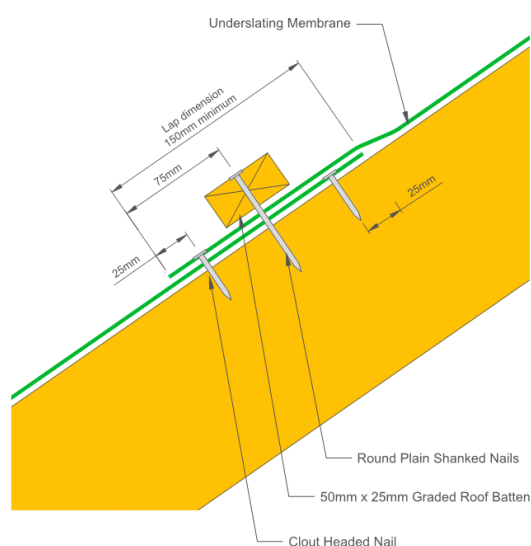
Figure 2: Creating the Overlap - Battened Overlap Detail

When being used unsupported, the roofing membrane should achieve a nominal 10mm drape in between the support positions in order to prevent contact with the underside of the tiles, thus avoiding the transfer of wind loading to the primary roof covering. The drape also serves as drainage for water within the batten space to the eaves position and into the gutter. Fully supported membranes i.e. installed over sarking boards must incorporate counter battens.