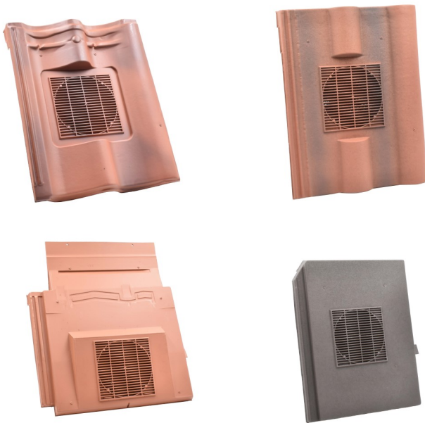
Due to different computer monitors/calibrations the images shown may not be an accurate representation of the final products colour.

In-Line ventilators are designed to maximise the aesthetic features of the roof by being virtually unseen. All In-line vents are designed to fit seamlessly with its intended tile profile, whilst providing either roof space ventilation or an outlet for mechanical extraction.