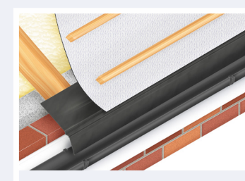
Rigid Support Tray Product Code: HDRFST