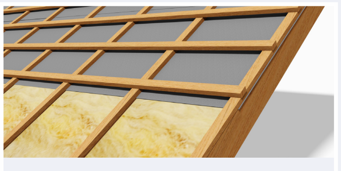
Draped over rafters - fully supported warm roof