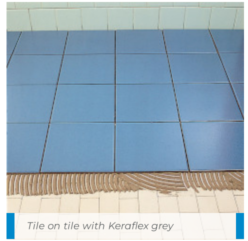
Tile on tile with Keraflex grey