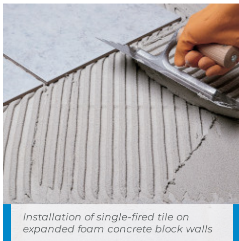
Installation of single-fired tile on expanded foam concrete block walls