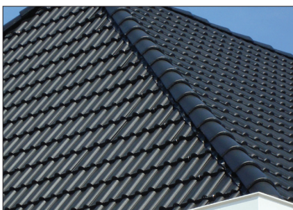
Crest Nelskamp Dry Fixing System.

*As per European trademark Nr.7287956, filed on 2nd October 2008, the Trademark PLANUM belongs to La Escandella. It is Dachziegelwerke Nelskamp as authorized licensee of the owner allowed to use the mark PLANUM for its concrete product.