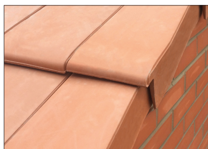
Crest Nelskamp clay right hand cloaked verge.