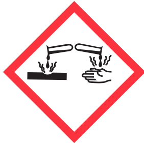
CONTAINS CHROMIUM (VI)

DANGER Causes skin irritation. Harmful if swallowed. Causes serious eye damage. May cause respiratory irritation. Keep out of reach of children. Avoid breathing dust. Wear protective gloves and eye protection. Wash hands thoroughly after handling. IF SKIN IRRITATION OCCURS: Get medical advice/attention. IF SWALLOWED: Call a poison centre or doctor/physician if you feel unwell. IF IN EYES: Rinse cautiously with water for several minutes. Remove contact lenses, if present and easy to do. Continue rinsing. Immediately call a poison centre or doctor/physician. Dispose of contents/container in accordance with local/regional regulations. Repeated exposure may cause skin dryness and cracking. CONTAINS CHROMIUM (VI) May produce an allergic reaction. To avoid risks to human health and the environment, comply with instructions for use. Safety data sheet available on request.