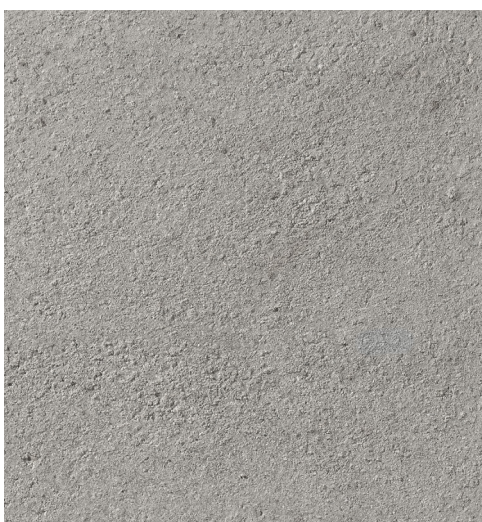
NATURAL GREY NEW