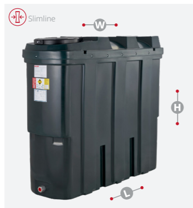
SL1235BT W 650mm H 1660mm L 2000mm

Nominal Capacity: 1000 Litres Brimful Capacity: 1024 Litres Tank Footprint: 610mm x 1860mm Weight: 125 kgs