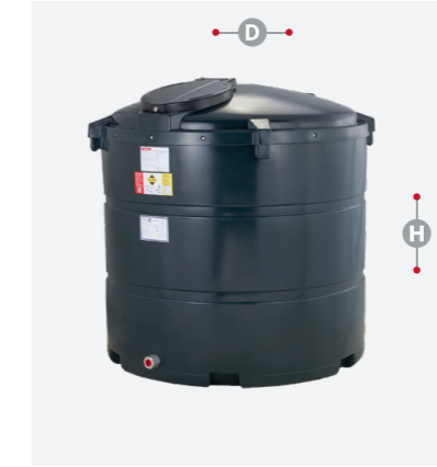
V1340BT D 1410mm H 1530mm

Nominal Capacity: 1230 Litres Brimful Capacity: 1234 Litres Tank Footprint: 1230mm Weight: 96 kgs