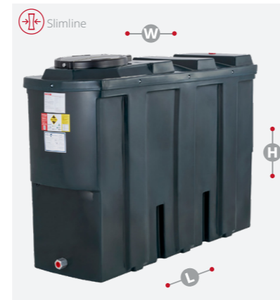
SL1000BT W 645mm H 1340mm L 1890mm

Nominal Capacity: 650 Litres Brimful Capacity: 703 Litres Tank Footprint: 605mm x 1170mm Weight: 100 kgs