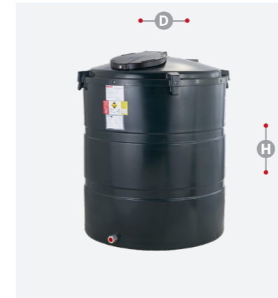
V1230BT D 1250mm H 1600mm

Nominal Capacity: 1230 Litres Brimful Capacity: 1234 Litres Tank Footprint: 1230mm Weight: 96 kgs