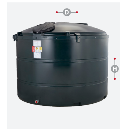
V3500BT D 2120mm H 1600mm

Nominal Capacity: 2350 Litres Brimful Capacity: 2448 Litres Tank Footprint: 1650mm Weight: 155 kgs