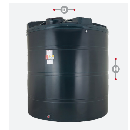
V9200BT D 2510mm H 2800mm

Nominal Capacity: 5000 Litres Brimful Capacity: 5216 Litres Tank Footprint: 2060mm Weight: 265 kgs