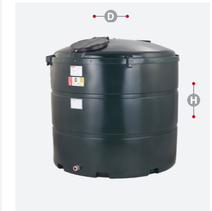
V2350BT D 1710mm H 1650mm

Nominal Capacity: 1340 Litres Brimful Capacity: 1369 Litres Tank Footprint: 1390mm Weight: 107 kgs