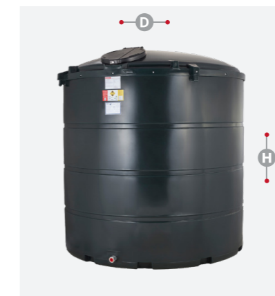
V5000BT D 2120mm H 2300mm

Nominal Capacity: 3500 Litres Brimful Capacity: 3661 Litres Tank Footprint: 2060mm Weight: 195 kgs