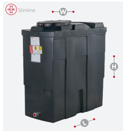
SL650BT W 630mm H 1350mm L 1300mm

Nominal Capacity: 650 Litres Brimful Capacity: 703 Litres Tank Footprint: 605mm x 1170mm Weight: 100 kgs