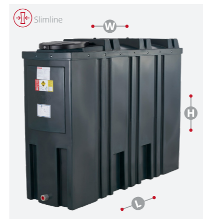
SL1400BT W 660mm H 1695mm L 2140mm

Nominal Capacity: 1235 Litres Brimful Capacity: 1238 Litres Tank Footprint: 610mm x 1860mm Weight: 155 kgs