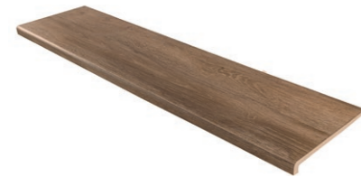
Peldaño Extrusionado 32x120