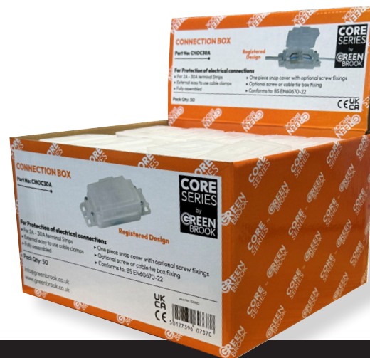
POS Display Qty 50

NOTE: Terminal Block not included with CHOC30A