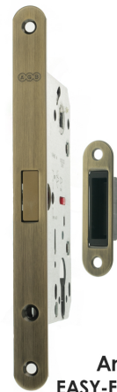
Antique Brass (AB) EASY-FIX Strike Plate Pictured