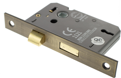
Product Finish Pictured: Matt Antique Brass (MAB)