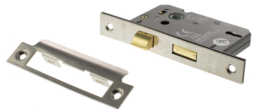
Product Finish Pictured: Polished Nickel (PN)