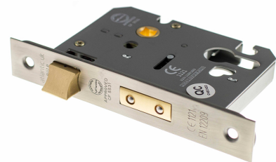
Product Finish Pictured: Matt Gun Metal (MBN)