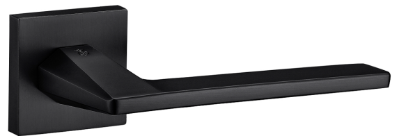
Finish Photographed: Matt Black (MB)