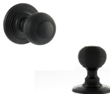
Product Finish Pictured: Matt Black