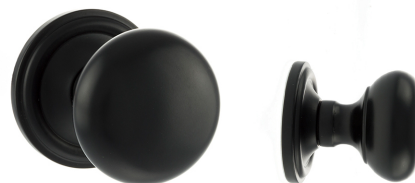
Product Finish Pictured: Matt Black