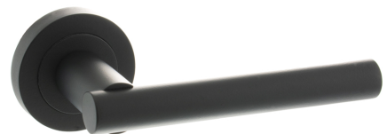
Product Finish Pictured: Matt Black