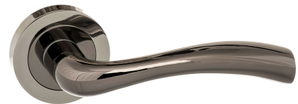
Product Finish Pictured: Black Nickel