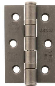
Product Finish Pictured: Distressed Silver (DS)