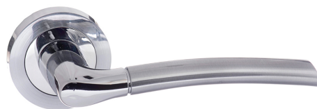
Product Finish Pictured: Satin Chrome / Polished Chrome