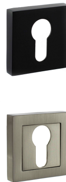
Product Finish Pictured: Matt Black & Satin Nickel