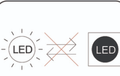
Non-replaceable light source