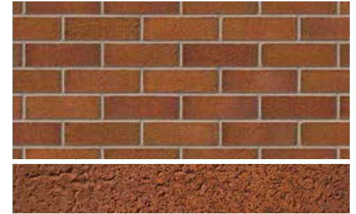
Tradesman Sandfaced Red Multi WIRECUT