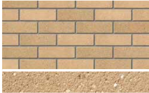
Tradesman Millgate Buff WIRECUT