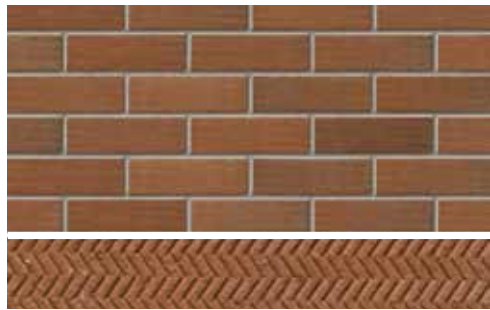
Tradesman Rustic Blend WIRECUT