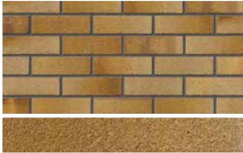
Tradesman Buff Multi WIRECUT