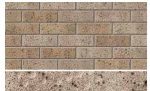
Tradesman Antique Grey WIRECUT