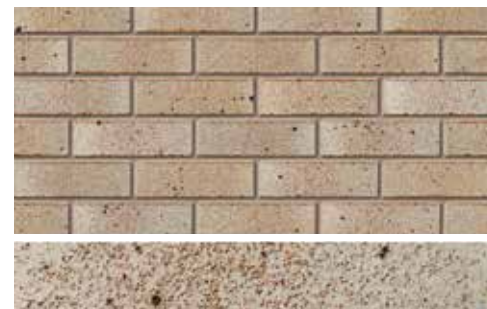
Tradesman Light WIRECUT