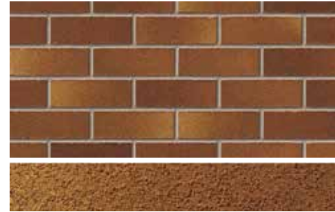
Tradesman Heather Mixture WIRECUT