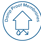
Damp Proof Membrane