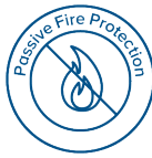
Passive Fire Protection