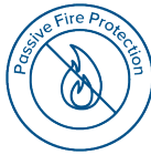
Passive Fire Protection